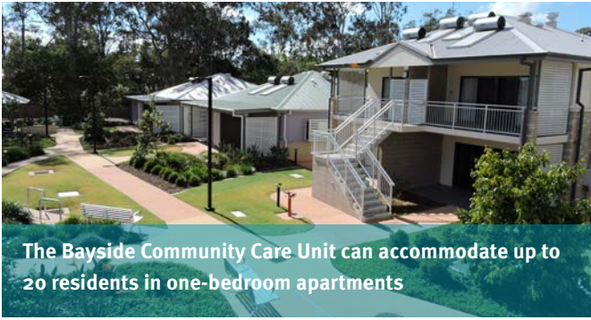
The Bayside Community Care Unit can accommodate up to 20 residents in one-bedroom apartments