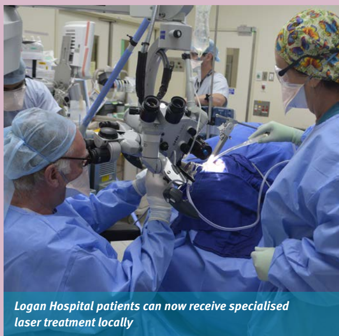
Logan Hospital patients can now receive specialised laser treatment locally

Patients at Logan Hospital now have access to specialised laser throat surgery after the arrival of a CO 2 laser machine at the facility's Ear Nose and Throat (ENT) department.