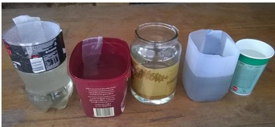
A. Container examples

Dark containers are most attractive to domestic, or urban, moszgies. If you don't have a dark container, you can place your container inside something darker, like a black plant pot bucket (see B, below).