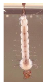
F. Mozzie larva or 'wiggler'