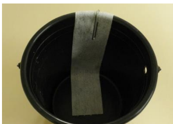
C. Egg collection strip fixed to side of container

3. Hang the 'egg collection strip' (supplied) inside the container, so that it touches the bottom. Fix it in place (see C, below) using a paper clip (supplied). Trim off any excess strip outside of the container (see D, below).