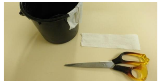
D. Trim off any excess length from strip

4. Fill the container with tap water (about three-quarters full); enough to last for two - three weeks.