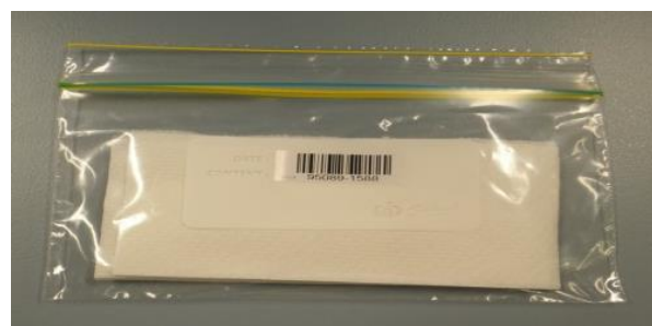
H. Place the sealed bag in the pre-addressed envelope and return.