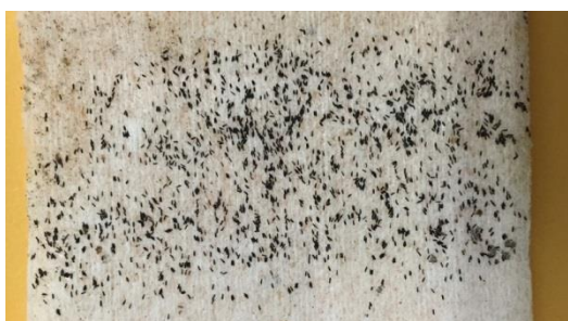
E. Mozzie eggs on strip

The eggs need to stay unhatched. Please do not refill the bucket or splash water to prevent eggs hatching. If you see mozzie larvae ('wigglers'; see F, below), please tip the water out.