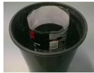
B. Light container inside a dark bucket

2. Rinse your container twice with clean water before use. You may need to cut off the top of plastic containers to create a large opening to easily allow moszgies to enter (see A, above).