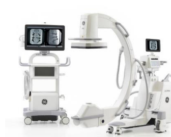
Surgery - C-arms