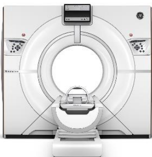
CT, MR, Nuclear