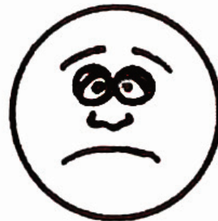
Hurts Even More