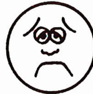
Hurts Whole Lot