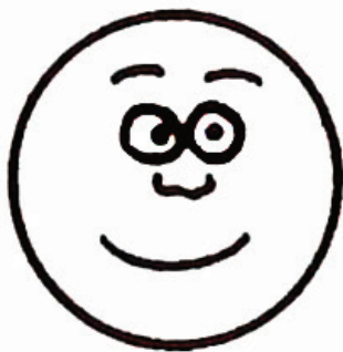
Hurts Little Bit