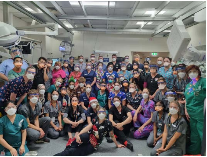
The two major trauma rooms are serviced directly by a CT scanner in an adjoining room, which allows for integrated imaging and trauma resuscitation

The department has 25 acute care beds and 5 resuscitation rooms. These in combination with a 14-bed short stay unit, Ambulatory Care and dedicated Toxicology and Mental Health units, allow for specialised directed care.