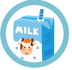
Eat and drink only pasteurised products

There is a Q fever vaccine available for people aged 15 years and older. If you work, live or holiday near animals who may carry the germ, talk to your doctor about getting a Q fever vaccine.