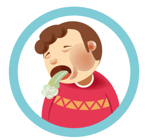
Nausea, vomiting and weight loss