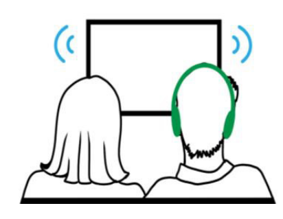
The TV or radio